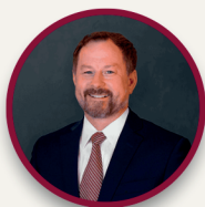
Rep. Brad Barker (R) HD 58