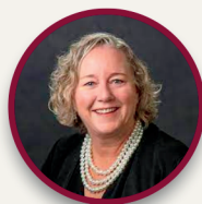
Sen. Shannon O'Brien (D) SD 46